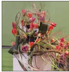
View dazzling displays at the Philadelphia Flower Show