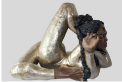
Gwendolyn R. Lanier-Gardner

The Contortionist , stoneware, cone 5 glazes, patina, and gems, 14.5 x 20 in