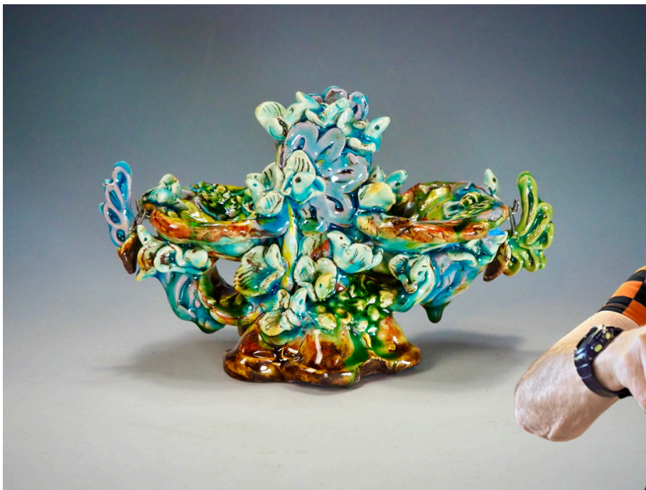
Lisa Orr, Salt and Pepper Centerpiece

Lisa Orr has been a studio potter for over 40 years. Orr's ceramics lushly blend historical, functional roots with organic, fluid forms that embrace gentle asymmetry. Inspired by nature and intuition, her richly textured and colorfully glazed slip-cast surfaces evoke birds on the wing, coral reefs, and blooming flowers, resulting in work that is vibrant, emotional, and assured. Currently refining an accessible smokeless wood kiln, she also teaches, lectures, and shows nationally and internationally. Her work has been placed in many public and private collections.